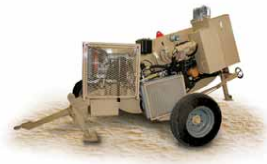
Mod. FRS 504

Complete with hydraulic power pack to control up to 2 separate drum stands with hydraulic motor, not independent control